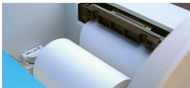
Simple changing of the thermopaper for the built-in printer. Rollwidth: 57 mm, diameter: 50 mm.