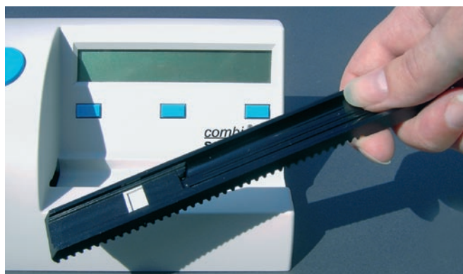
The changeable strip holder can easily be removed for cleaning.